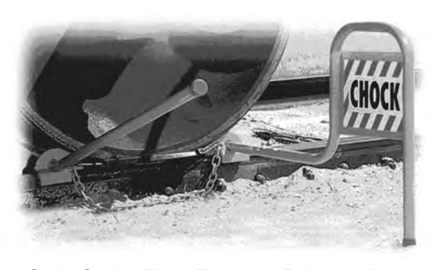
Style C with Flag, Exposed Rails, 16 lbs Style C-1 with Flag, Flush Rails, 16 lbs