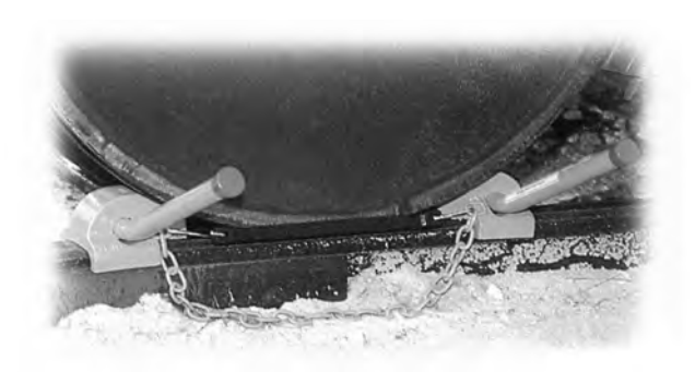
Style B without Flag, Exposed Rails, 12 lbs Style B-1 without Flag, Flush Rails, 12 lbs