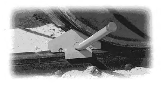
Style D without Flag, Exposed Rails, 6 lbs Style D-1 without Flag, Flush Rails, 8 lbs