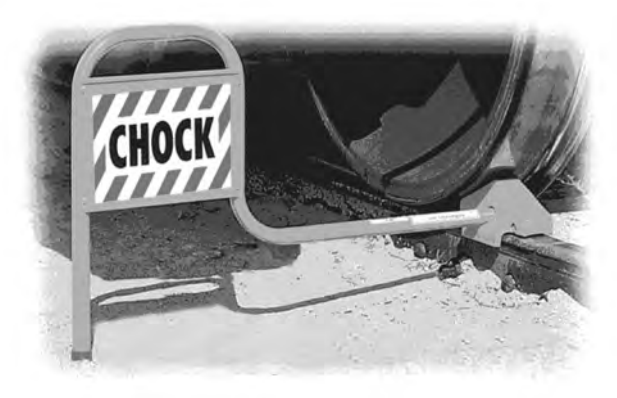
Style A with Flag, Exposed Rails, 13 lbs Style A-1 with Flag, Flush Rails, 13 lbs