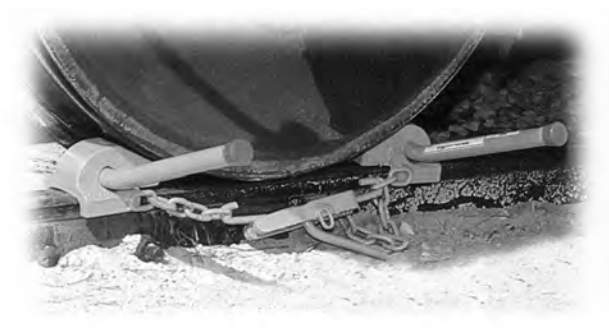
Style B-2 without Flag, w/Tightener, Exposed Rails, 16 lbs Style C-2 with Flag & Tightener, Exposed Rails, 20 lbs