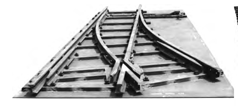
Left-Hand Turnout on Plate

Shown below are several examples of preassembled turnouts. These turnouts can be made from all new rail, all relay rail, or a combination of the two. They can also be mounted on one large steel plate for even greater strength and durability. Preassembled turnouts are normally made for applications utilizing rail up to 90-lb. per yard. When ordering, specify rail size, track gage, frog number, and whether the turnout is right-hand, left-hand or equilateral. Harmer can supply drawings showing detailed dimensions for your approval. Special crossovers, diamond crossings and other special trackwork formations are also available.