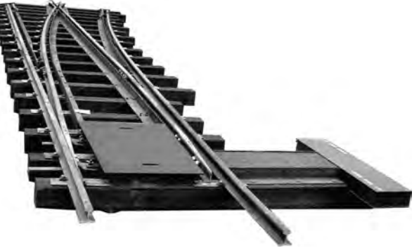
Right-Hand Pavement Turnout