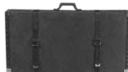
Carrying Case, 19 lbs