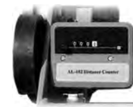
Distance Counter, 5 lbs