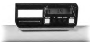
Digital Track Level, 5 lbs