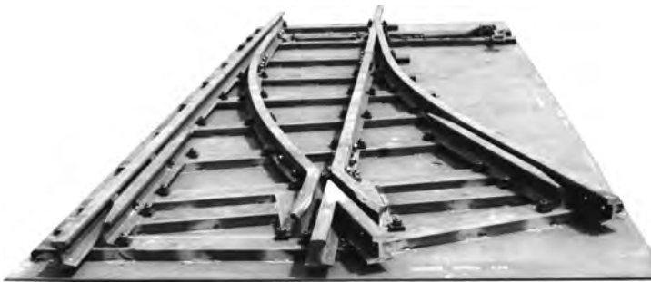
Left-Hand Turnout on Plate

Shown below are several examples of preassembled turnouts. These turnouts can be made from all new rail, all relay rail, or a combination of the two. They can also be mounted on one large steel plate for even greater strength and durability. Preassembled turnouts are normally made for applications utilizing rail up to 90-lb. per yard. When ordering, specify rail size, track gage, frog number, and whether the turnout is right-hand, left-hand or equilateral. Harmer can supply drawings showing detailed dimensions for your approval. Special crossovers, diamond crossings and other special trackwork formations are also available.