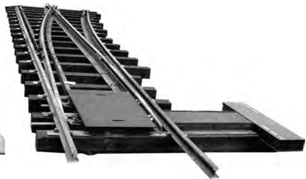
Right-Hand Pavement Turnout